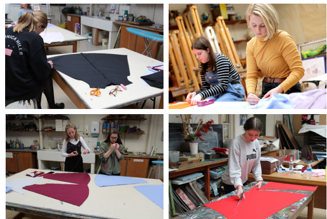
Figure 3: Collection of photographs showing the workshop in progress

The questions required respondents to provide information about their knowledge of fashion, their consumption habits, and their sewing skills. It was important to measure participants' interest in fashion prior to taking part in the workshop to provide a valid platform for comparing the data gathered at the conclusion of the workshop. At the end of the second day, participants completed questionnaire two, designed to evaluate engagement levels and collect participants' views on the workshop. The questions also aimed to explore whether participant involvement in the making of the garment would likely increase the participants' typical use of such a garment.