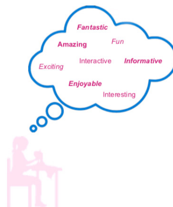
Figure 5: Participants one word summaries of the workshop (responses to question one on the Post-Workshop Questionnaire)

As highlighted, the participants all identified a prior interest in dressmaking, and were keen to begin the workshop. However, it was apparent that they wanted to achieve the end result straight away. This became obvious through a reluctance to fully read and understand the instructions. Rather than rely on problem solving skills, participants requested to be directly told or shown what to do. This desire to be immediately satisfied was reminiscent of literature exploring factors that have contributed to individuals expecting such immediate solutions [31] . However, once participants began to take ownership, the distractions disappeared, as seeing their work evolve encouraged them to continue, indicating positive reinforcement. One individual who had made significant progress by the end of the workshop exclaimed: “I just want to stay all night and finish it”. Informal questions and empirical observations during the class further enforced the importance of fashion to the individual and the connotation relating to perceived social identity. At the same time, awareness of sustainability issues and the underlying concerns were commonplace amongst the participants. Their knowledge of these issues was mostly conveyed through education and exposure to conventional media.