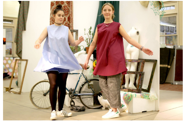
Figure 6: Photograph of participants wearing their ‘Segment Dresses’ during the workshop

In summary the final questionnaire distributed and collected six weeks post-workshop revealed that for the majority, an emotional attachment remained for their dresses. Of the participants, 21% had worn their dresses since taking part in the workshop and 64% of participants felt the experience of the workshop created an attachment to their dress. One participant wrote the reason being: “so much work went into it and it was the first time I made a garment with a sewing machine”. Perhaps more interestingly, just over half of the participants had kept up their sewing skills and indeed gone on to independently start new sewing projects. For example, one individual wrote: “I am making a short / top combo to take to Greece”, another explained: “I made a dress for my party”. Further examples included, trousers, and a scarf. The remaining participants returned to their default purchasing habits, citing limited time and/or lack of confidence in their sewing skills. The majority of participants were unsure if the workshop experience had created fond memories in relation to their garment, and they were 50/50 on the workshop experience creating an emotional attachment to the dress. Overall, with 9 of the 14 participants agreeing it is unlikely they will discard the dress; involvement in the making process decreased the likelihood of discarding the garment.