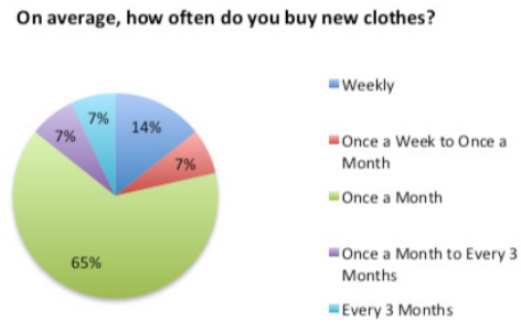
Figure 4: Pie Chart of participant responses to question 4 on the Pre-Workshop Questionnaire

As highlighted, the participants all identified a prior interest in dressmaking, and were keen to begin the workshop. However, it was apparent that they wanted to achieve the end result straight away. This became obvious through a reluctance to fully read and understand the instructions. Rather than rely on problem solving skills, participants requested to be directly told or shown what to do. This desire to be immediately satisfied was reminiscent of literature exploring factors that have contributed to individuals expecting such immediate solutions [31] . However, once participants began to take ownership, the distractions disappeared, as seeing their work evolve encouraged them to continue, indicating positive reinforcement. One individual who had made significant progress by the end of the workshop exclaimed: “I just want to stay all night and finish it”. Informal questions and empirical observations during the class further enforced the importance of fashion to the individual and the connotation relating to perceived social identity. At the same time, awareness of sustainability issues and the underlying concerns were commonplace amongst the participants. Their knowledge of these issues was mostly conveyed through education and exposure to conventional media.